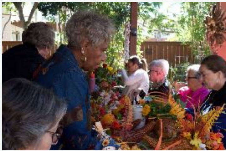
Cornucopia workshop at Leslie's house.